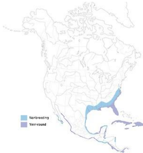
Figure 1. Normal breeding and nonbreeding range of the White Ibis.

No subspecies are recognized, but the Scarlet Ibis ( Eudocimus ruber ) of South America is closely related and is considered by some to be a conspecific color morph.